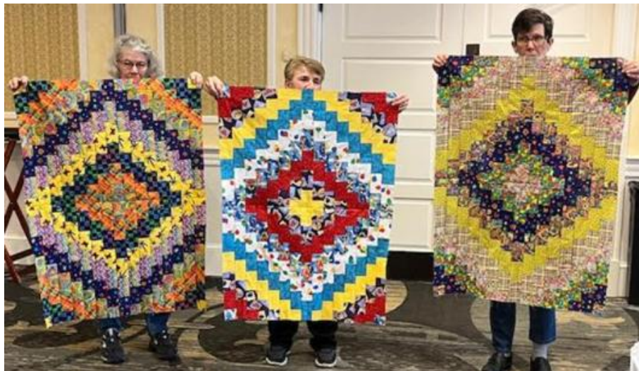
Beautiful work, ladies!