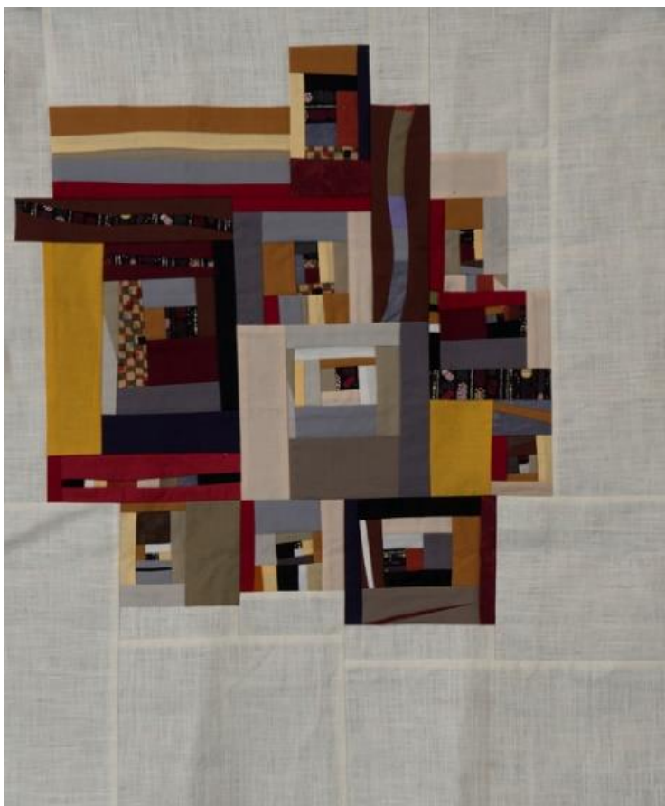
"Urban Cabin" 21.5" x 26" 2016