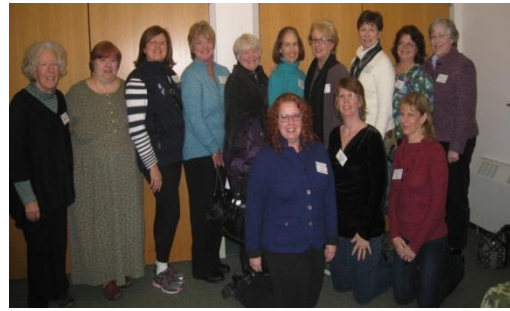
Welcome New Members!

The guild purchases batting and coffee, has thread to tie the quilts, and supplies a deli lunch for members (and friends, all are invited!) Members are requested to bring a quilt top with a back, and pot luck munchies (fruit, veggies, dessert, etc.).