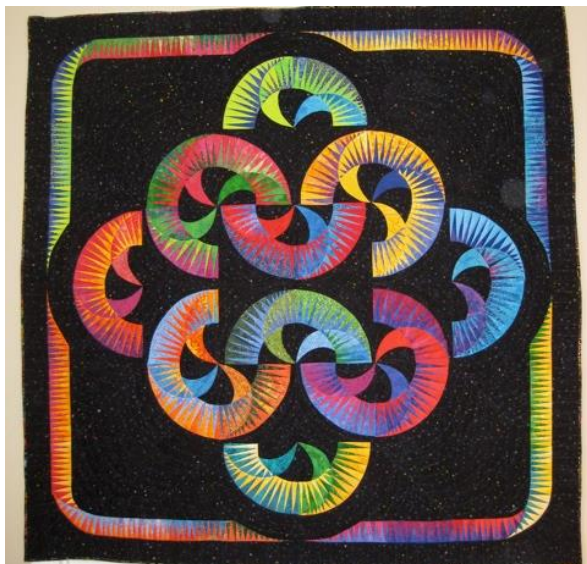
Claudette Cavalier's "Carnival" was selected at our quilt show to represent Concord Piecemakers at Images 2014

The two fabrics can be found at Quilter's Way in Acton if you wish to purchase additional fabric FPB2309-026 (Pink) and FWM2309-002 Begonia Leaves (Magenta).